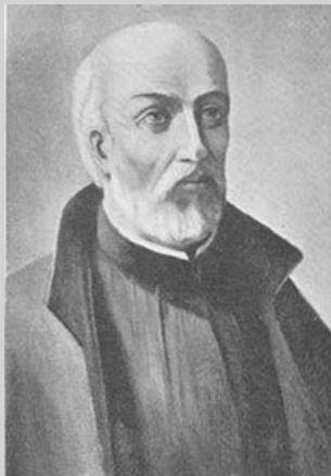
St. John de Brebeuf